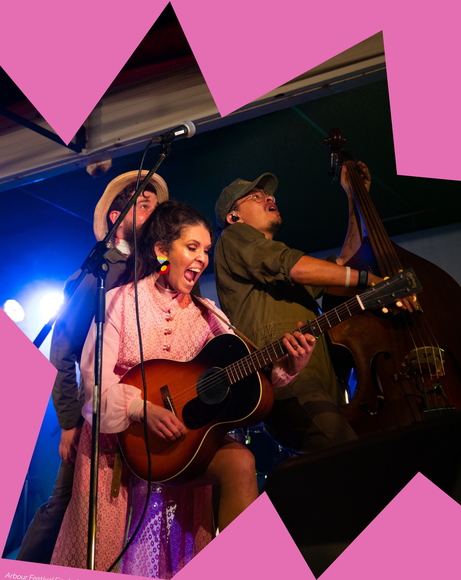
Arbour Festival Finale Concert